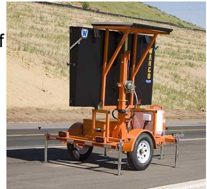
Mini - Travel Position